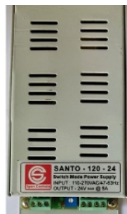
Span PS-24V 5A SMPS