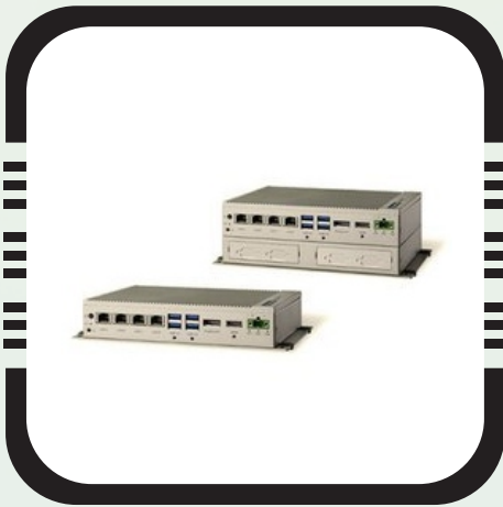
UNO-2483G Embedded Automation Computers