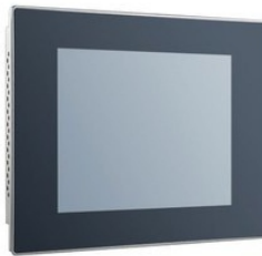
PPC-3060S Panel PC