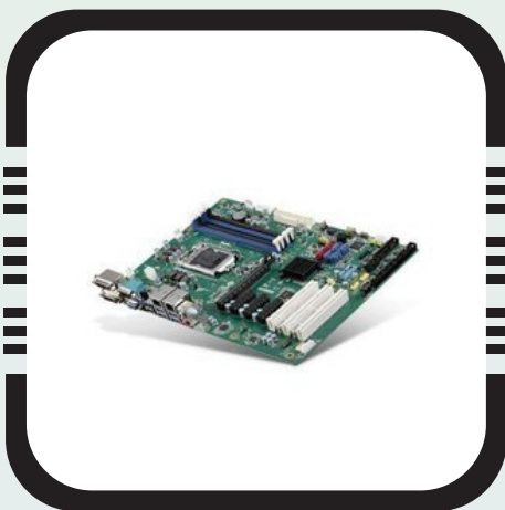
AIMB-785 Industrial Motherboard