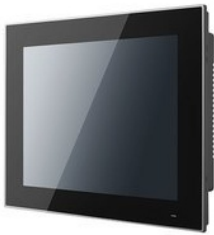
PPC-3120S Panel PC