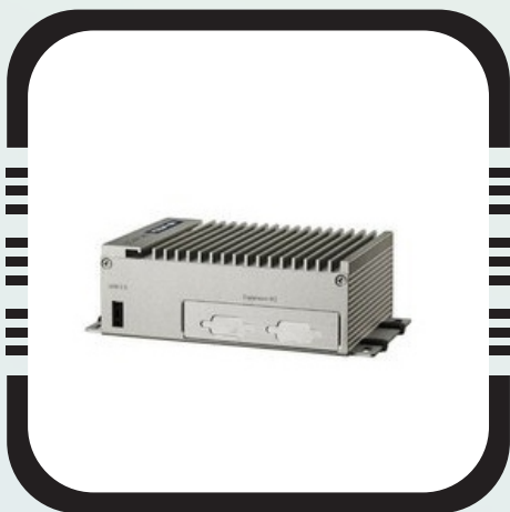
UNO-2272G Embedded Automation Computers