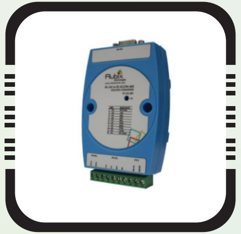
RS 232- 485 Converter