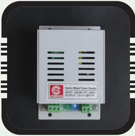
Span PS-12V 5A SMPS Output Voltage 12v Dc