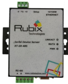
Serial Device Server