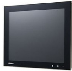
TPC-1782H Panel PC