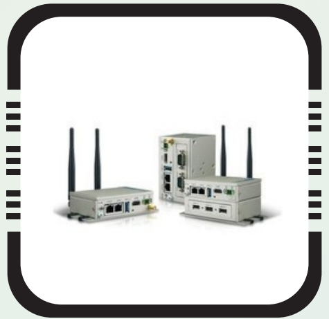
UNO-2271G Embedded Automation Computers