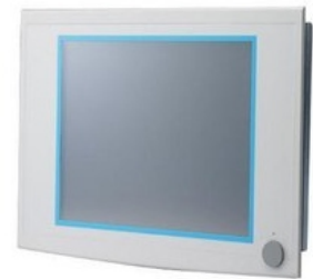
IPPC-6152A Panel PC