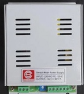
Span PS-12V 10A SMPS