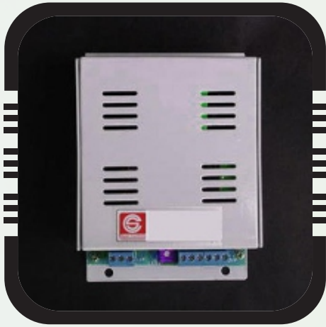
Span PS-12V 3A SMPS