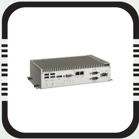
UNO-2473G Embedded Automation Computer